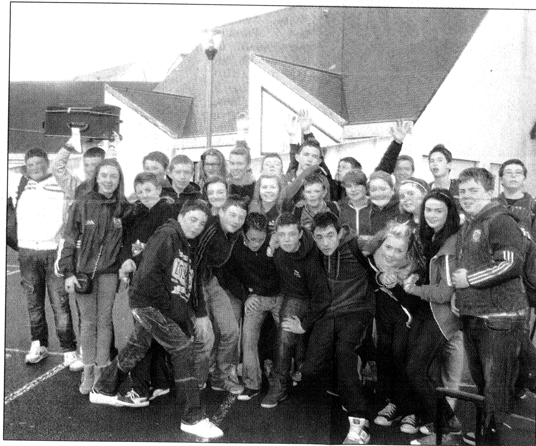
Students from Drumshanbo Vocational School who enjoyed a visit to Drumshanbo's twin town of Locquirec in Brittany, France.